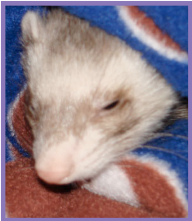
Thelma tries to nap while the annoying human futzes with some clicky thing...